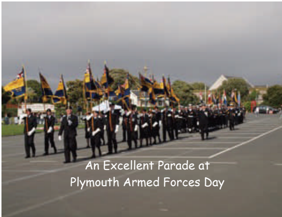
An Excellent Parade at Plymouth Armed Forces Day