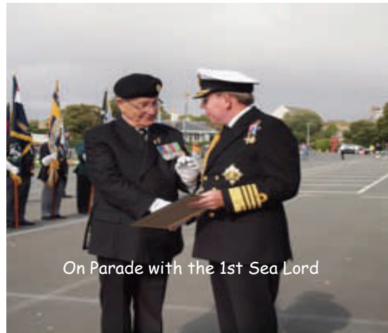
On Parade with the 1st Sea Lord