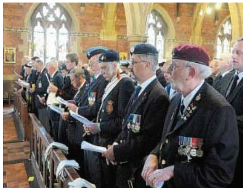
On Saturday 23 July 2011 The Royal British Legion Torquay branch held a 90th birthday party at All Saints Parish Church. A memorable day that raised nearly £1,500 for The Royal British Legion Anniversary Fund.