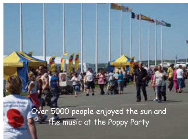
Over 5000 people enjoyed the sun and the music at the Poppy Party