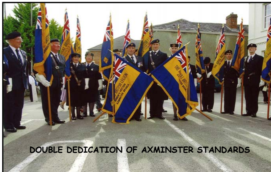
DOUBLE DEDICATION OF AXMINSTER STANDARDS