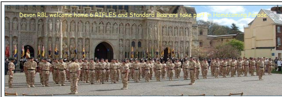
Devon RBL welcome home 6 RIFLES and Standard Bearers take part in Homecoming Parade.