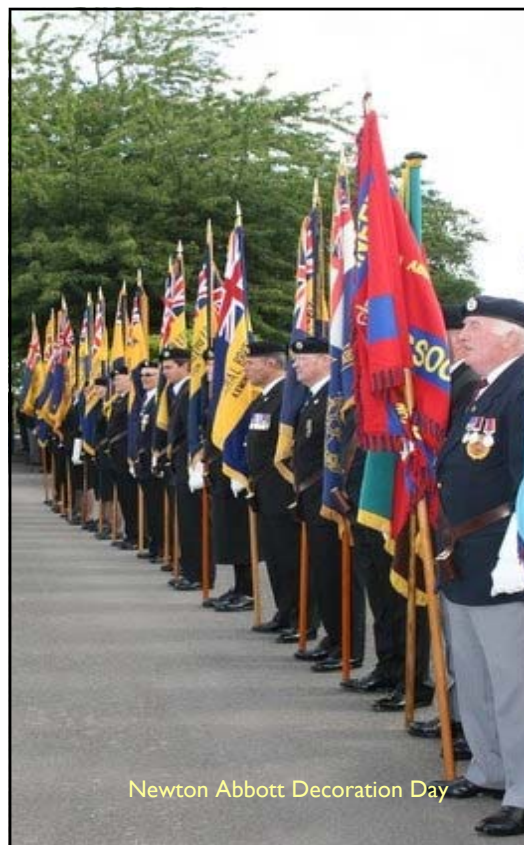
Newton Abbott Decoration Day

Wednesday 2 Sep 09 Barnstaple TA Centre. Wednesday 16 Sep 09 Crownhill Fort, Plymouth. Wednesday 23 Sep 09 County Office, Exeter.