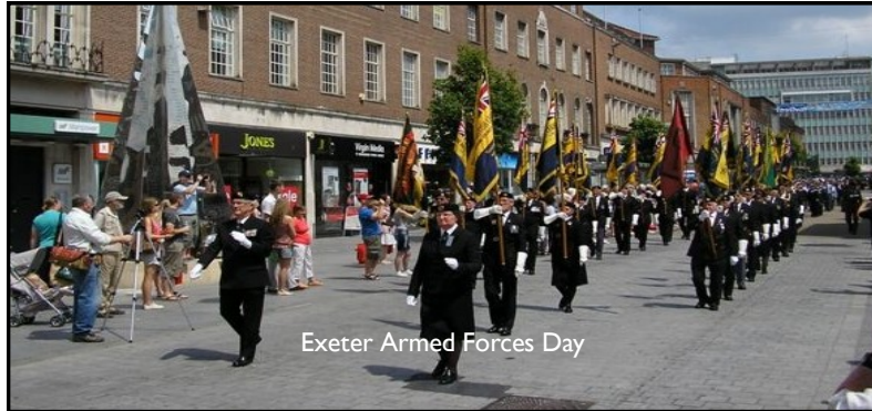
Exeter Armed Forces Day

90th Anniversary Mystery Tour 25/27 Mar 11